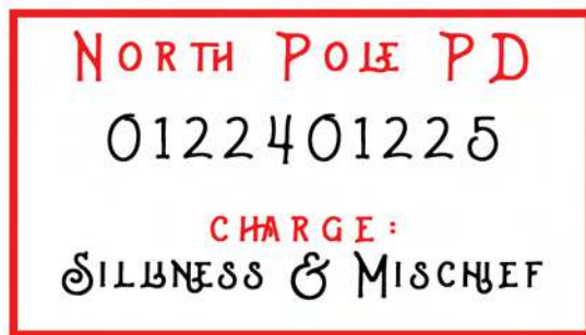
Elf Booking Sign Add String and hang around elf's neck, or tape to hands.